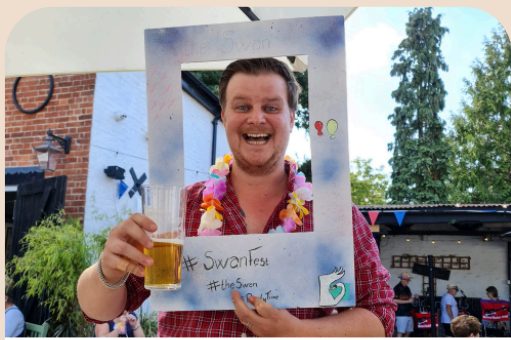
Sat 16th Aug Cycle Hub 'away day' to Windsor & Eton Brewery for #SWANFEST